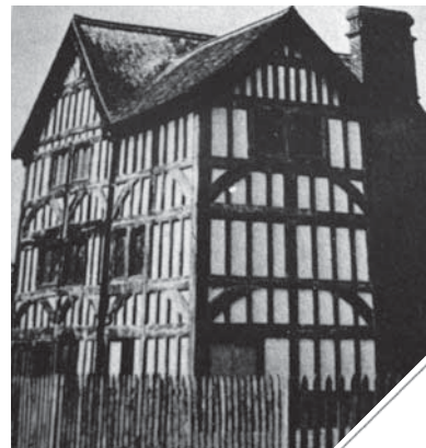
Figure i-2 English Half-Timber Bent Style

After the fall of the Roman Empire, Europe underwent tremendous growth in urbanization spurred by the emergence of new countries, states and kings. Heinrich I, during his reign as Germany's first monarch from AD 912-936, made the decision to bring his peasant commerce within the fortified walls of his castles as protection from the marauding Huns, creating the first medieval cities. Space in these new cities was very limited, requiring a building system that was fast and efficient and would lend itself to additions and renovations. The rural methods of log 'blockwork' and post and beam 'frame and rubble' was just not portable enough. The answer was 'braced' timber framework, the inclusion of diagonal kneebraising gave the structural rigidity to be easily assembled between existing buildings. The infill walls could proceed after the roof was placed. Refer to Figure i-2.