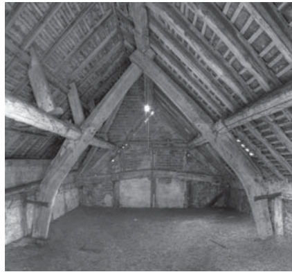
Figure i-1 Bent Cruck Frame

'Bent' is an early English construction term referring to the 'cruck' method of building, where a crooked or bent tree would be riven (split) into two lengths and bound (bent) together at the ridge, held apart with a collar tie and raised into position to form an A shape bent cruck frame. A number of these bent cruck frames would serve as sectional supports for the connecting beams and purlins. Refer to Figure i-1.